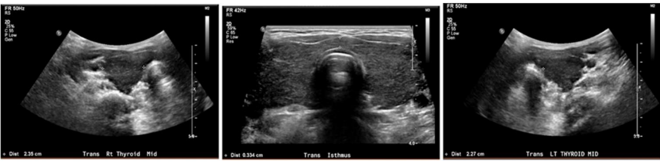
Figure 1: Ultrasound of thyroid gland transverse view showing an enlarged right, left lobe and isthmus with mild diffuse heterogeneity throughout the thyroid parenchyma.

At that time, her pre-operative ultrasound (Figure 1) demonstrated an enlarged thyroid gland, with the right lobe at 7.2 \times 1.9 \times 2.4 cm, the left lobe at 6.2 \times 2.0 \times 2.7 cm, and the isthmus measured 3mm. There was notably mild diffuse heterogeneity throughout the thyroid parenchyma with no discrete nodules identified. At her initial operation, she was described to have a bilateral multinodular goiter with surrounding adhesions from thyroiditis. Specimen pathology demonstrated diffuse follicular hyperplasia with papillary infoldings and hypertrophy of follicular cells with colloid showing peripheral scalloping consistent with Graves' disease. Post-operatively, she was started on 100 mcg of levothyroxine daily.