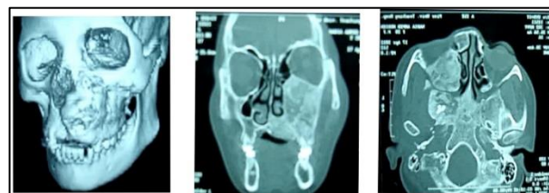
Figure 4: CT scan views of the lesion.

The working differential diagnosis included ossifying fibroma, fibrous dysplasia, giant cell granuloma, calcifying odontogenic cysts, calcifying epithelial odontogenic (Pindborg) tumor. An incisional biopsy was thus undertaken, and histopathologic examination revealed proliferating sheets of spindle-shaped fibroblasts stroma with evident deposition of lamellar bone, which is consistent with ossifying fibroma. Because serum levels for calcium, phosphate, alkaline phosphatase and parathyroid hormone were all normal, conditions like hyperparathyroidism and Paget's disease were excluded. In view of the recurrent nature of the disease in this patient, en bloc surgical resection (hemi-maxillectomy) of the affected area was undertaken with subsequent construction of an obturator (Figure 5). Under GA with nasotracheal intubation, the lesion was approached by Weber-Ferguson with a lip split approach. A hemi-maxillectomy type of resection was accomplished using a reciprocating saw and different sizes of osteotomes. The resection was extended beyond the midline. Following the resection, the wound bed was washed out, debrided and all bleeding points were controlled. The wound bed was then packed with petrolatum gauze, and a prefabricated maxillary obturator was inserted, fitted and