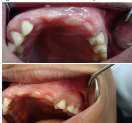
Figure 2: The intraoral presentation of the lesion.

The swelling was non-tender, non-mobile and bony hard in consistency. There was no ulceration or any other mucosal abnormalities. In view of the likelihood that the lesion was of bony origin, radiology was requested. A panoramic view showed a large, diffuse, mixed radiolucent-radiopaque lesion of the left maxillary bone, while an occipitomental view (OMV) showed a large, diffuse radio-opaque lesion obscuring the left maxillary sinus (Figure 3). A subsequent computed tomography (CT) scan revealed a large, mixed radiolucent-radiopaque lesion with predominant homogenous radiopacity occupying the entire left maxillary alveolar and basal bones. The left maxillary antrum was completely occupied by the lesion that abruptly stopped at the midline, while the nasal septum deviated to the right (Figure 4).