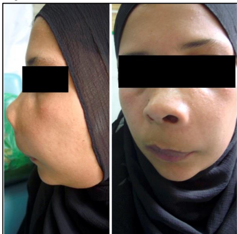
Figure 1: Front and side views of the patient.

General examination showed that all of the patient's vital signs were within the normal range. Extra-oral examination revealed a large, diffuse swelling over the left cheek, extending from the upper lip to the left side of the nose obliterating the nasolabial fold and causing deviation of the nose to the right (Figure 1). There were no palpable lymph nodes in the head and neck region. Intra-orally, the upper right and left central and lateral incisors, as well as the upper left canine, were missing. All the remaining teeth in the maxillary left quadrant were vital. There was a diffuse, expansile swelling involving the left maxillary anterior region, measuring approximately 6 × 4 cm, extending antero-posteriorly from the midline to the left upper 2 nd molar, and obliterating the labial and left buccal vestibule. Palatally, there was a bony bulge extending from the left alveolar segment and ending abruptly just short of the midline (Figure 2).