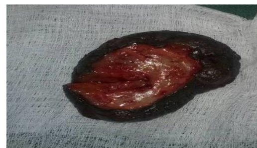
Figure 2: Excised PNF.

We had a total of five cases over the study period. Three males and two females, the youngest was 2 weeks old while the oldest was a 22-year-old man (Table 1).