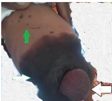
Figure 1: A neonate with lumbosacral PNF and hyperpigmented macule.

Key: * plexiform neurofibroma, ** neurofibromatosis.