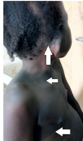
Figure 4: Superior arrow shows right temporal PNF, other arrows show hyperpigmented macules.