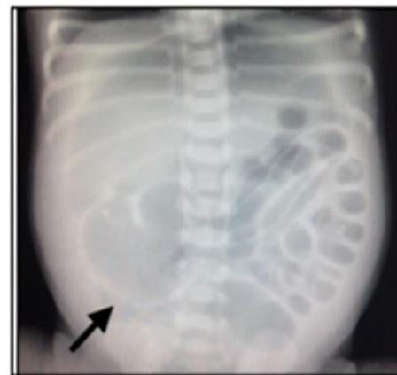
Figure 3: X-ray abdomen AP supine view showing dilated loops and a pneumoperitoneum suggested by football sign. Also, can be seen is a cystic calcified lesion in the right iliac fossa (arrow) suggestive of a meconium pseudocyst.

Baby B, term 2.8 kg female was born to a primigravida mother at an outside hospital with no antenatal risk factor. Born through elective cesarean and cried at birth with normal APGAR's. Baby was started on feeds. There was progressive abdominal distension with bilious aspirates and respiratory distress. Baby was made nil per mouth and referred at 20 hours of life. At admission baby was in cardiorespiratory failure, was resuscitated with ventilation, intravenous fluids, antibiotics and nasogastric drainage. Abdomen was grossly distended, tense and tender and tympanic with positive transillumination. An urgent x-ray revealed a pneumoperitoneum and a cystic lesion in right iliac region with perilesional calcification suggestive of a meconium pseudocyst and antenatal perforation (Figure 3).