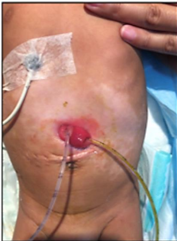
Figure 2: Picture shows proximal stoma on the right and distal stoma on the left of the figure. This technique was innovated for management of short gut. But the stomas have tubes inserted for collection. The proximal stoma output is continuously collected in sterile bag and is inserted under aseptic conditions into the distal stoma intermittently.

Thorough peritoneal lavage was done with warm normal saline, volvulus was corrected, and gut health assessed, the atretic segment was resected and the proximal and distal ileum were brought out as stoma using the double barrel technique. In the postoperative period, parenteral nutrition and antibiotics were continued. Baby received N-acetyl cysteine through nasogastric tube for clearing the thick meconium. Feeds were gradually introduced from post-operative day 10. Baby started having loose stools following feed introduction. Sepsis workup and stool cultures were sent which were sterile. Feeds were changed initially to lactose free formula and later even to elementary formula. As loose stools persisted and fluid requirement was high, an innovative method was used wherein the proximal stoma output was collected in a sterile bag and put back into the distal stoma under aseptic conditions (Figure 2).