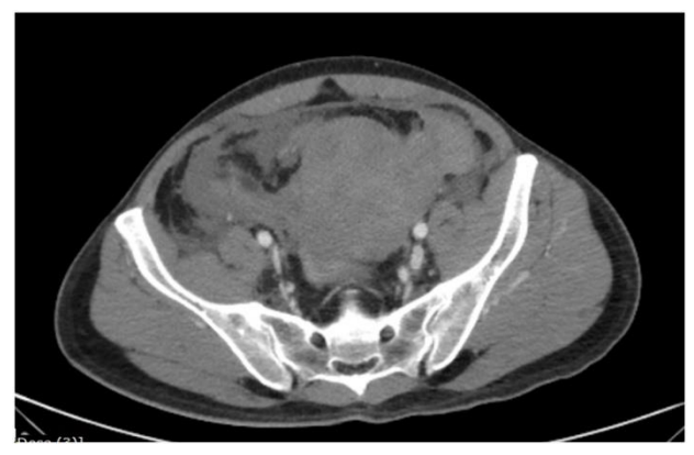
Figure 1: CT abdomen – pelvic hematoma and intraperitoneal blood.