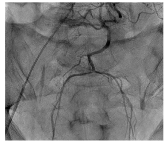
Figure 2: IMA angiogram - No contrast leak.