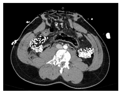
Figure 1: CT scan, performed postoperatively. Representative image showing the patient's L3 three-column fracture, with concern for bone fragments in the spinal canal. Trauma packing in right and left hemiabdomen.

Once stabilized, the patient underwent computed tomography of his chest, abdomen and pelvis with thoracic and lumbar spine reconstructions. Final radiographic reads showed a three-column injury at the level of L3 with an associated fracture of the vertebral body. No active bleeding was noted.