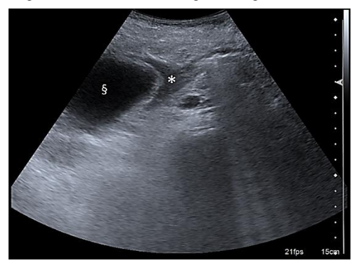
Figure 1: Ultrasound cross-section of the gallbladder (§) shows thickened walls due to acute inflammation. The "Phrygian cap" sign is pathognomonic for gallbladder volvulus (*) and led to the diagnosis in the case presented.

requested. Clinical examination showed abdominal tenderness on palpation in right hypochondrium with positive Murphy and Blumberg's signs. To exclude the presence of bile duct obstruction and further clarify the diagnosis of acute alithiasic cholecystitis, abdominal ultrasound was repeated. This second examination showed a clear "Phrygian cap" sign (Figure 1) which led to the diagnosis of gallbladder volvulus.