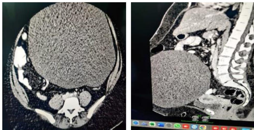
Figure 1: CT Scan report.

The surgical approach undertaken was Non-Descent Vaginal Hysterectomy (VH) along with the right sided & left sided salpingo-oophorectomy.