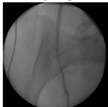
Figure 5: Antegrade ureterogram following removal of sutures. No transition point present.