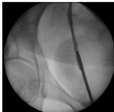
Figure 6: Follow up retrograde right ureterography via ureteroscope inserted in right ureteric orifice. Normal flow of contrast retrogrades and macroscopically the ureter looked normal at the previous site of injury.