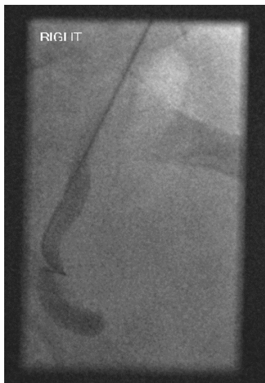
Figure 2: Fluoroscopy image of antegrade right ureterography with attempted guide wire insertion passed lower ureteric stricture. The interventional radiologist was unable to pass this stricture.