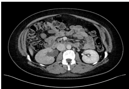
Figure 1: CT Urogram showing right hydroureter and hydronephrosis.