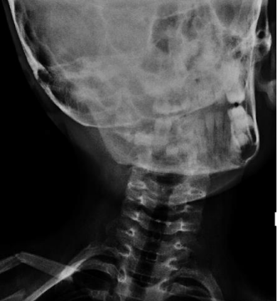
Figure 2: Image of cervical X-ray of patient upon presentation to ED. While read as unremarkable except for a fractured clavicle during the time, it is quite clear that atlanto-axial subluxation is present, as indicated by the quite prominent "Cock-Robin" head position.

We report a seven-year-old girl who presented with headache, neck pain, and the inability to straighten her head into a neutral position. Her parents reported a fall out of bed to her pediatrician. The child was initially referred to an orthopedic surgeon. A cervical spine X-ray series only reported a fractured clavicle (Figure 2). A few weeks later, when the torticollis had not resolved, computerized tomography (CT) of the cervical spine was recommended by pediatric neurosurgery in the emergency department (ED). Three-dimensional (3D) reconstruction imaging of the cervical spine revealed atlanto-axial subluxation (Figure 3). Magnetic resonance imaging (MRI) of the cervical spine the next day was unremarkable and demonstrated an intact spinal cord with no inflammation.