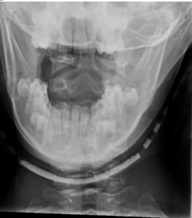
Figure 4: Image of open mouth odontoid radiograph of patient. In comparison to the pre-treatment images, this most recent image confirms the complete resolution of C1-C2 subluxation. The head and neck are in the neutral position and can be moved with ease.